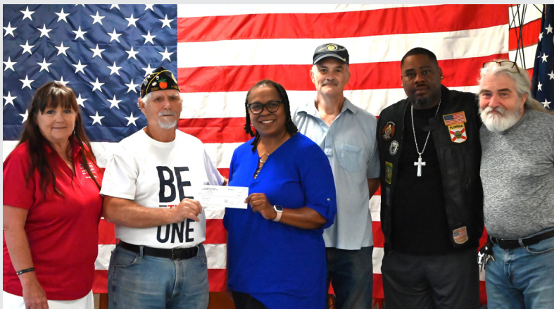
Sacred Heart Donation