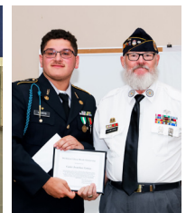
WO Robert Edwin Woods Scholarship Award Presentation to Boca Ciega JROTC Cadet