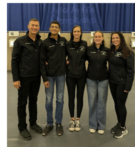
JSSP 2025 National Final Competition Mariner AJROTC

The 2025 National JSSP Postal Marksmanship Competition will be available to register online on the National Legion website on September 1. There are no changes this year, and all information will be in the Post Chairman packets. All teams must be sponsored by an American Legion Post, and the coach for the team must undergo the background clearance and Safe Sports Training as last year. Let's see if we're able to get a greater response in Florida this year for a valuable youth program. Please reach out to me if you have any problems, and may you all have a very successful year ahead.