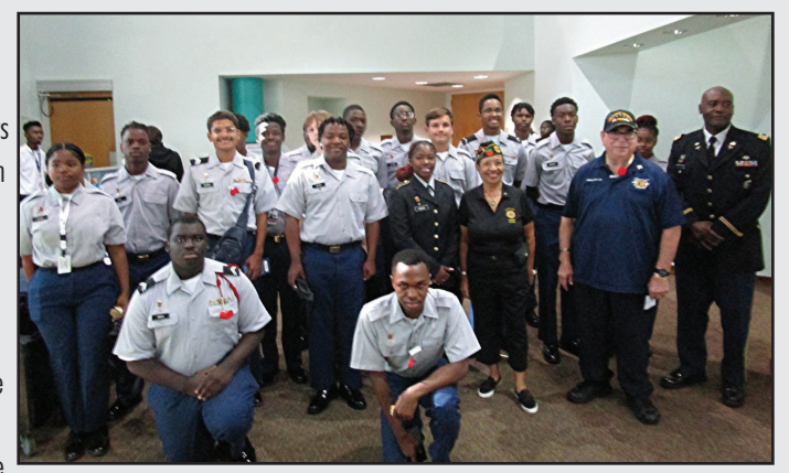
Piper AJROTC Cadets at Veterans Day Program at the Sunrise Theater

last minute. If you have any questions or concerns, please feel free to contact me. I look forward to hearing from the Posts about your programs and would like to feature articles about what your post is doing. Thanks so much to all who support our JROTC and JSSP programs; this is our future.