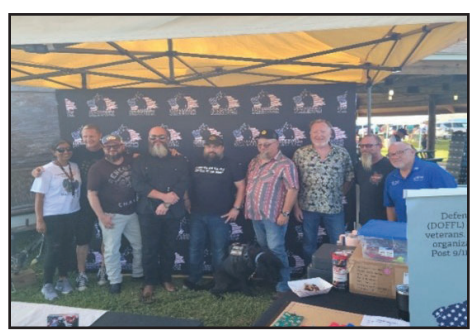
VA Entitlements continued on page 20 >>