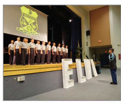
ELMA Semester Kickoff 2023 24

in Melbourne, which is ongoing from Sept. 1st through Dec. 31st. They accept team registrations, consisting of a 4-person team for the Sporter Category only. The school can be contacted directly for any questions or registrations. Packets for the JROTC/JSSP Program have been sent out, and all information included in the packets can also be found on the Department website. Thanks to all our Posts and Legionnaires who are supporting our youth programs, and I wish you continued success. Have a great year.