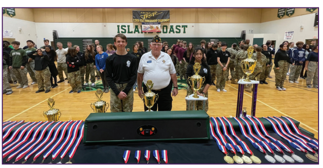
JROTC Island Coast Marksmanship