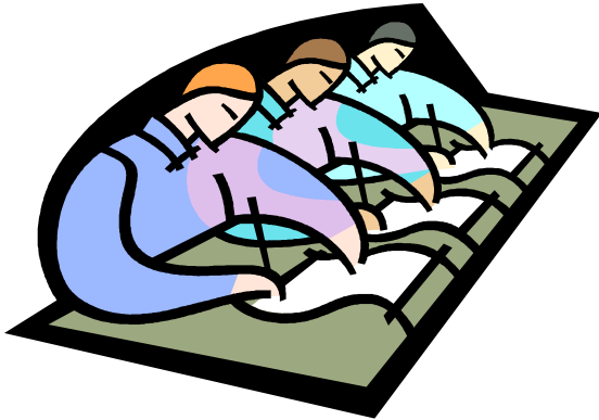
Individual Members Report