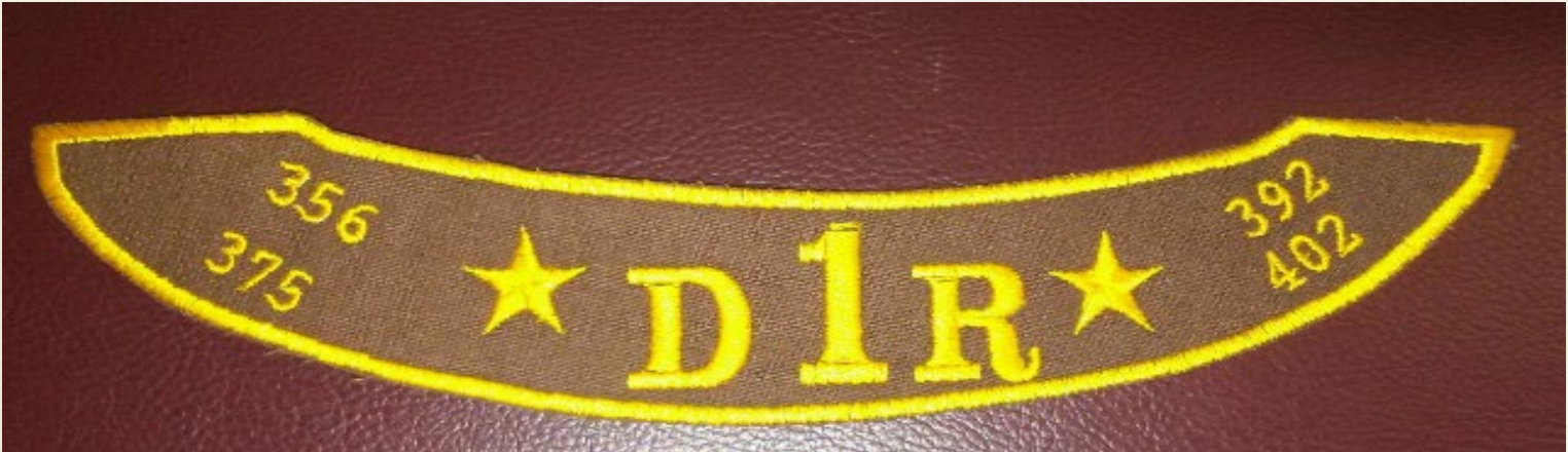
District 1 – D1R West Patch