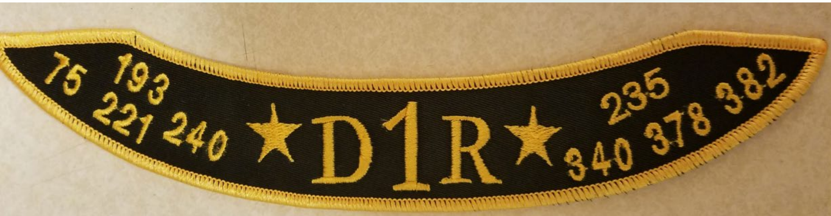
District 1 – D1R East Patch