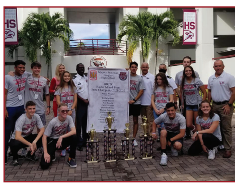
MSD First Place in FL Mixed Raider Meet

Post Commander sign and return to sponsor the team. The results for the marksmanship teams will be posted on the Legion National JSSP after all targets are fired and returned by the next deadline Feb. 1st. I'm available to assist you at any time, please contact me. Thanks for all your efforts and may you all have a pleasant year-end and Happy New Year.