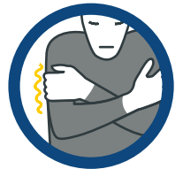
Aches and pains