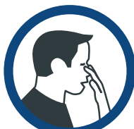
Do not touch your eyes, nose and mouth with unwashed hands