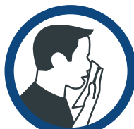
Or cover your mouth and nose with tissue when you cough or sneeze