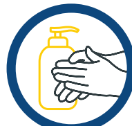
Use hand alcohol-based sanitizers