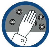
Avoid direct contact with surfaces