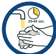
Wash your hands with soap and water frequently