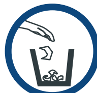
Dispose of the used tissue immediately