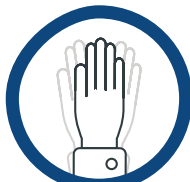
Avoid direct contact with others (cheek and nose greetings, shaking hands, kissing and hugging)