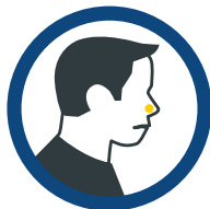
Nasal congestion, runny nose