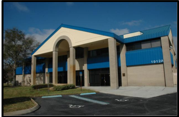
View from outside the building.