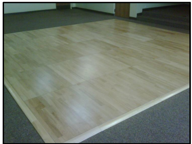
DANCE FLOOR available for rent!