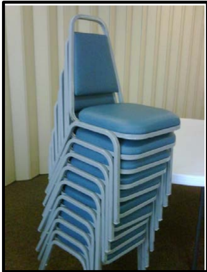
Standard Banquet Chairs

Our multi-purpose room can accommodate up to 200 people. The room can also be divided into three separate function areas to allow for a more private venue for smaller functions, groups or classes.