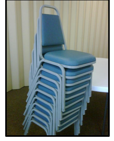
Standard Banquet Chairs